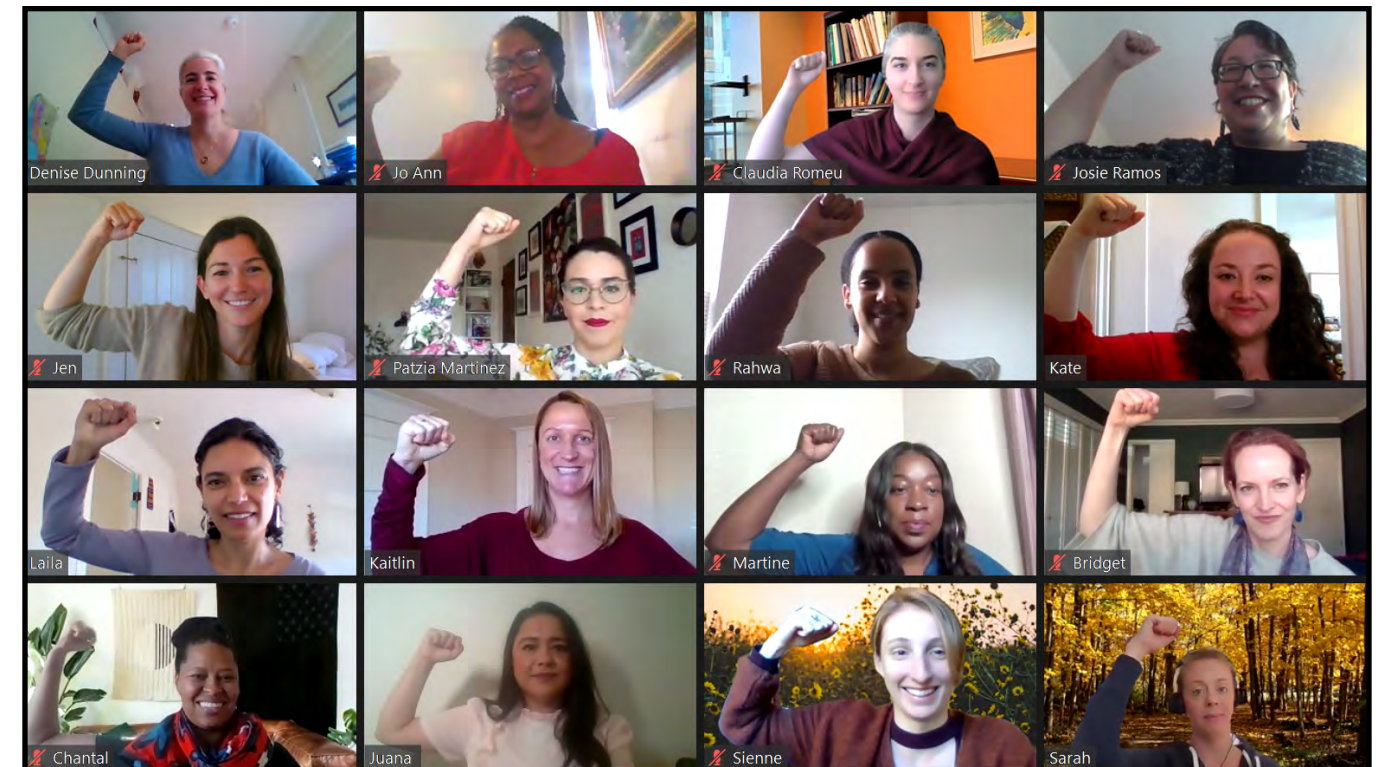
The Rise Up team together on Zoom in 2020

With your support, Rise Up launched new programs in Brazil and South Africa, welcomed 89 new visionary local leaders to our global network, and provided over $600,000 in grants to Rise Up Leaders and their organizations in 2020. We were also honored to have Rise Up's award-winning model highlighted in the United Nation's report When Children Take the Lead and the Stanford Social Innovation Review .