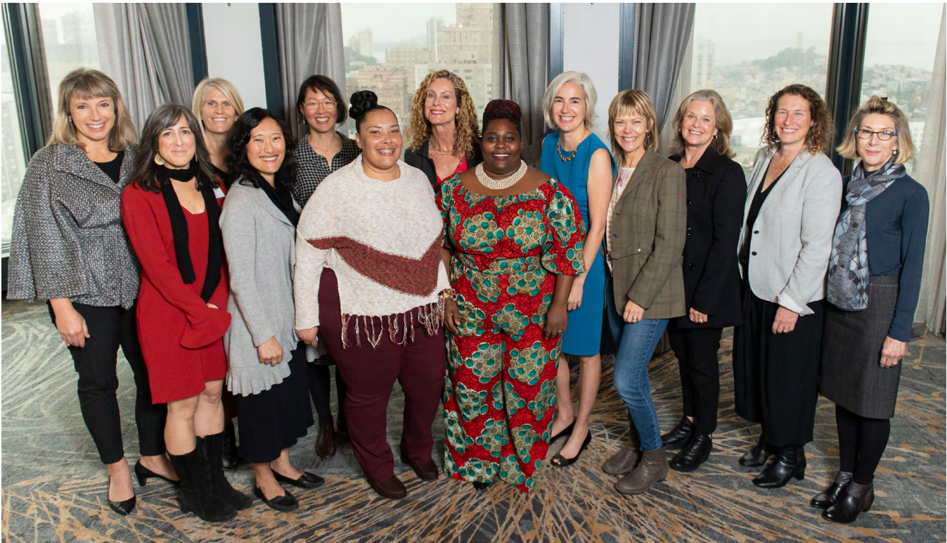
Rise Up Leadership Council members with Rise Up Leaders in 2019

In 2020 Rise Up’s Leadership Council raised critical funds to drive change for girls and women, directly contributing $233,456 and leveraging their networks to raise over $200,000 more to support our work. We are deeply grateful to our Leadership Council members for their commitment, support, and dedication to creating a more just and equitable world.