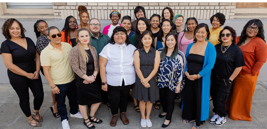
Rise Up Leaders at our Leadership & Advocacy Accelerator in California, September 2024.